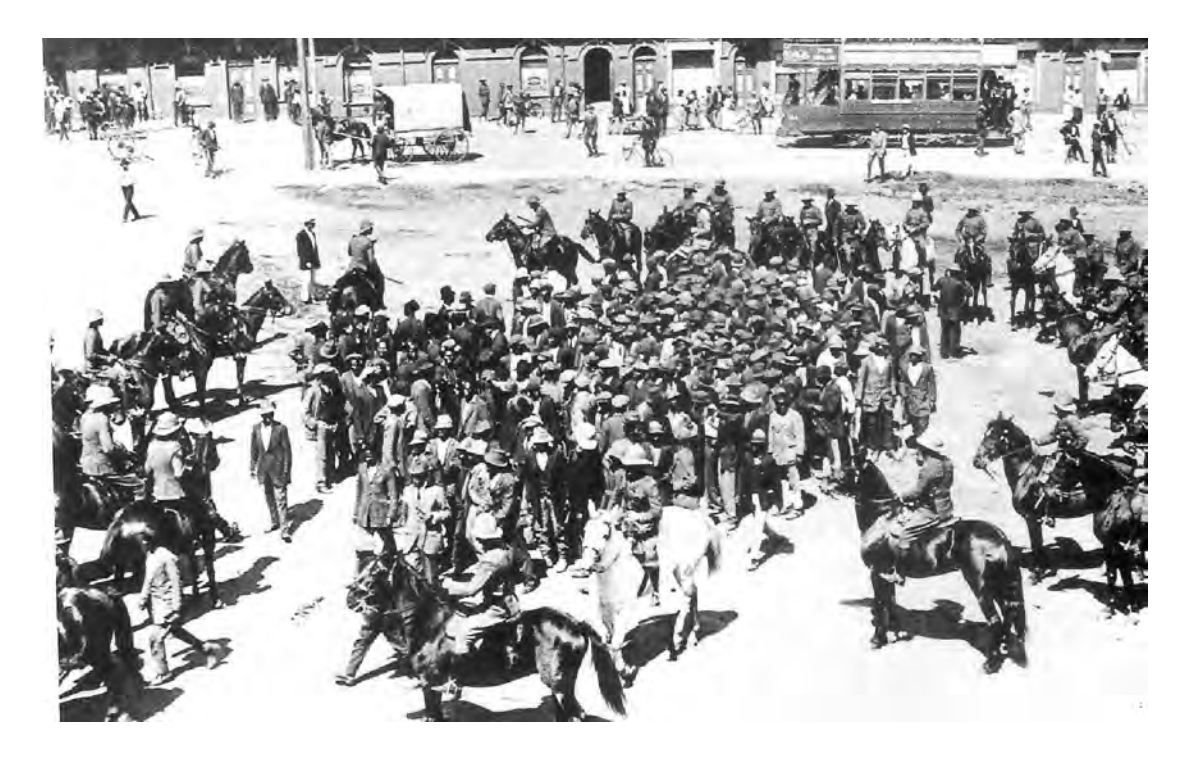
A photograph of anti-pass demonstrators in Johannesburg in 1919. All the people in the crowd are under arrest.

18 Look at the photograph, and then answer the questions which follow.