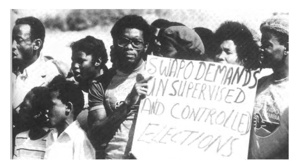
A photograph of Namibian demonstrators at the time of the elections organised by the South Africans in December 1978.

19 Look at the photograph, and then answer the questions which follow.