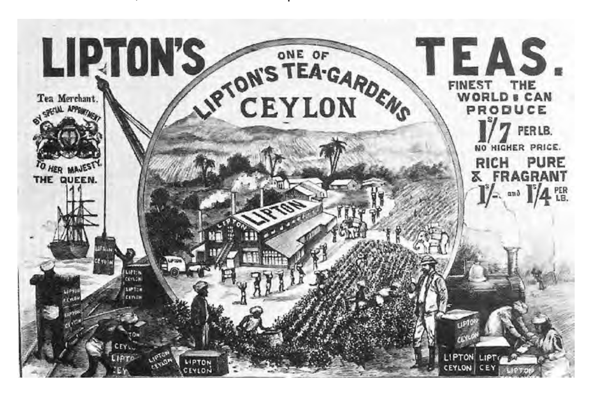
A nineteenth-century advertisement showing a tea plantation in Ceylon. Ceylon is now called Sri Lanka.

24 Look at the illustration, and then answer the questions which follow.