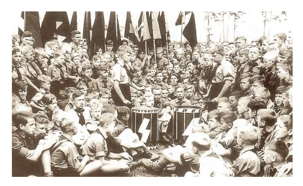
A photograph of members of the Hitler Youth taken in the 1930s.

10 Look at the photograph, and then answer the questions which follow.