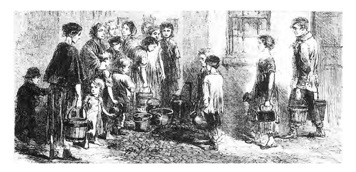
An engraving from 1862 showing daily life in an industrial town.

22 Look at the illustration, and then answer the questions which follow.