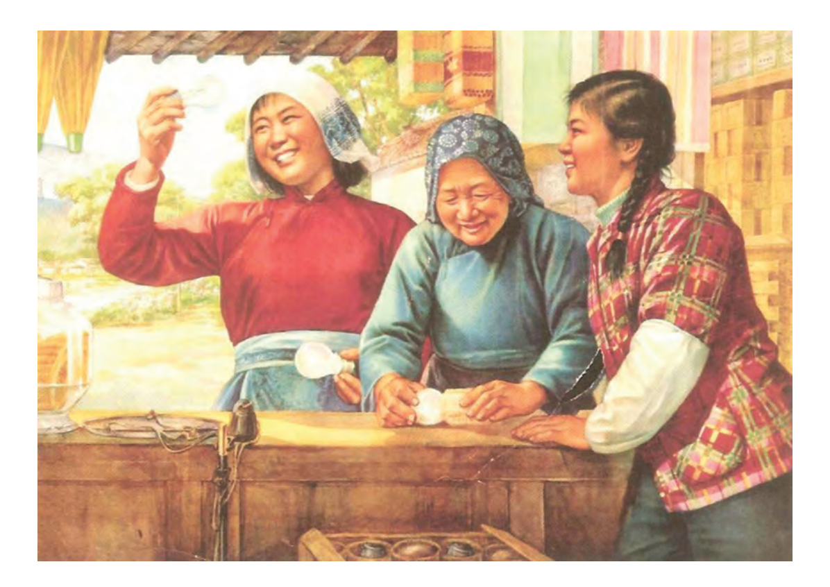
A poster entitled 'Electricity reaches our village', published in 1965.

16 Look at the poster, and then answer the questions which follow.