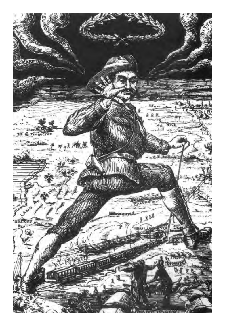
THE AMBITIONS OF CECIL RHODES

17 Look at the cartoon, and then answer the questions which follow.